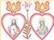
Sacred Hearts of Jesus and Mary